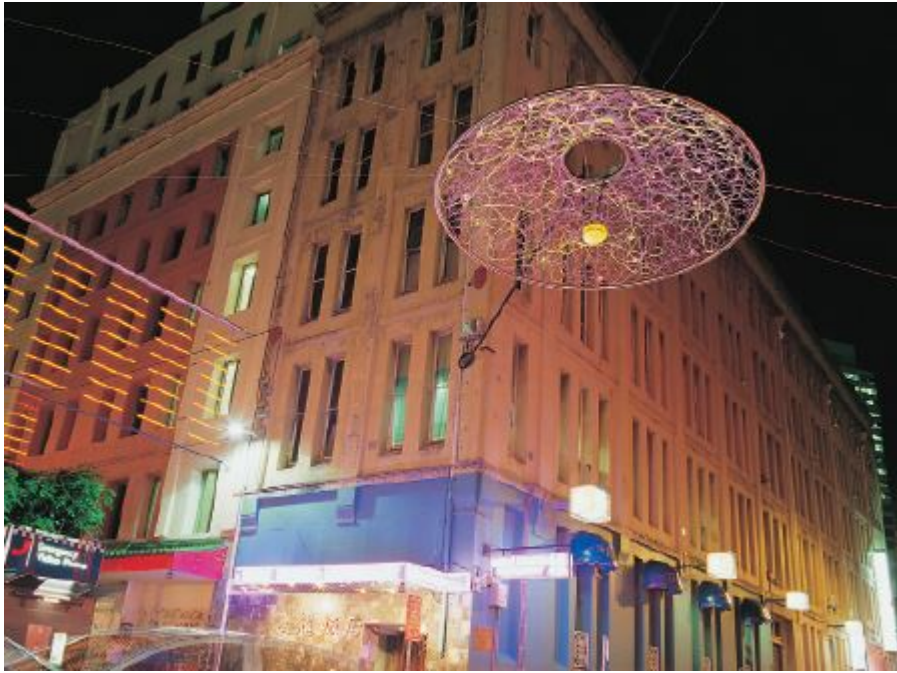
Heaven Lighting artwork when originally installed 1997